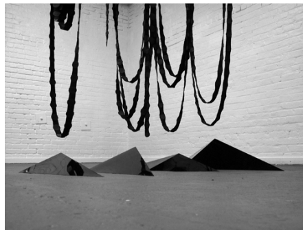
Sarah E. Wood, Diamond Shadow , 12 x 4 x 6 feet, elastic, vinyl, plastic

Recalling American sculptors of the 60's and 70's, Sarah E. Wood's shadows look like nothing I've ever seen. Previously, they took on the form of diamonds, pools of vinyl fabric, and arranged string. This month at Kate Werble Gallery, they don't seem like shadows whatsoever. Most likely they are not. A rubber wheel and a mess of black woven material each hang from paired wooden disks. The forms strangely relate, though beyond a few basic color and sympathetic patterns it's hard to identify precisely why. Undoubtedly a play on words, her exhibition Wait , speaks both to the weight of the form and the soft feeling of anticipation the hanging object evokes.