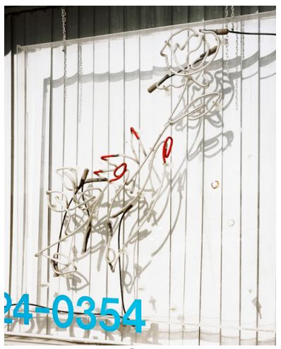
John Lehr, Gibberish, 2010

This is a clean, well-lit show of mostly clean, mostly well lit scenes. Although locations are unidentified, most seem to be taken in a suburban seaside small town. All the photographs are tightly cropped and we see only store windows and facades. In some windows there are letters and signs, in others, just sunlit shades. The images are not ironic to any great extent; rather the artist seems to be concerned with more formal questions, particularly about color. Almost all the pictures have large areas of white, notoriously the hardest part of a color photograph to print convincingly, and all come through without flying color casts.