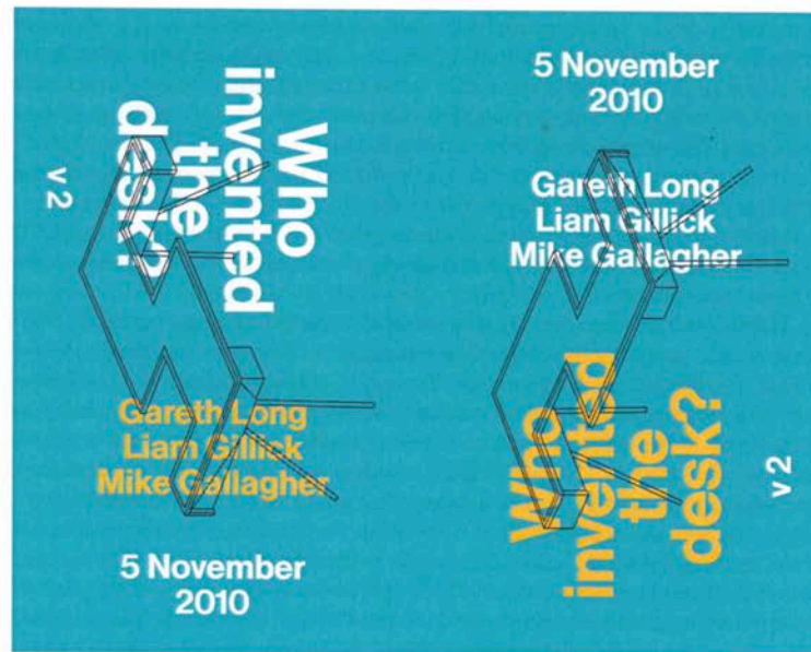
Figure 2: Gareth Long, cover of Who Invented the Desk. Volume 2 (2010)

generates meaning out of the complex series of collaborations and encounters that lead to and follow from the moment of its inception. This disruption of the sculptural object is compounded by the fact that the desks are not simply forms to be contemplated but retain their status as functional furniture, as everyday desks, when they are used for talks, at art fairs, or as a place for Long to work.