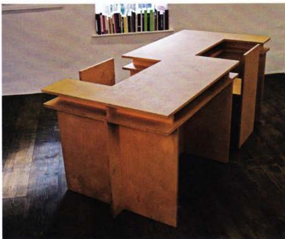
LEFT Bouvard and Pécuchet's Invented Desk For Copying [Version Nine] 2010 Birch 76.2 cm x 91.4 cm x 1.82 m

When comparing your Don Quixote with Books (Untitled) , the difference lies in your style of appropriation: the former is heavy and obvious, while the latter is notably light-handed. The sources of Books (Untitled) are appropriated with such a minor change it's remarkable. You have only taken away the cover text. On each book you've removed the title, the author's name, the publisher's imprint,